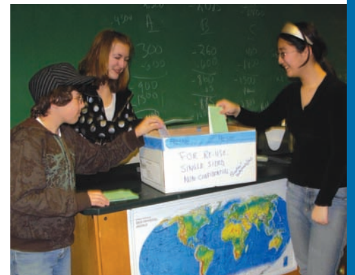
Members of the Environmental Club make scratch pads from recycled paper.